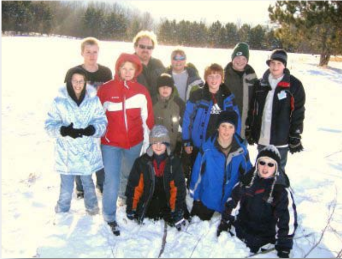
Last year's group on top!

We will meet at the Hixon Forest parking lot after classes on Saturday, February 28th, at 3:15 pm. You can do a shorter hike, then go back (about 15-20 minutes, good for littler kids) or you can do "The Loop" which goes all the way up to the top and back, about 2 hours! To get to the trail take Highway 16 to Bluff Pass (North of the Nature Center, IMMEDIATELY after the bridge), then a quick right. (Follow the signs) The parking lot is at the end of the road.