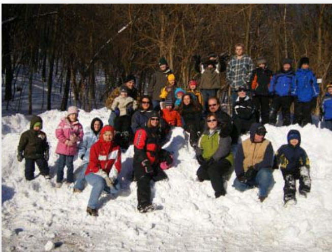
The whole 2008 group!