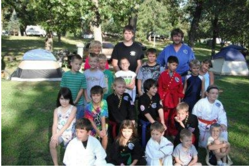
2012 Saturday morning class!

http://www.whisperingpinescampground.net/