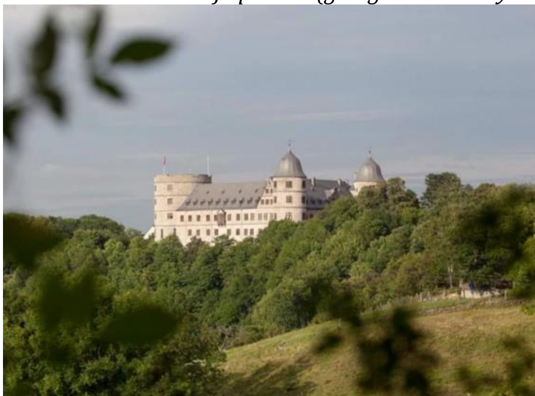
We train in the section of the castle with the flags on it. (It looks like the rook in chess!)