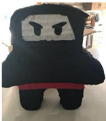
ninja piñata! (going down at day camp!)