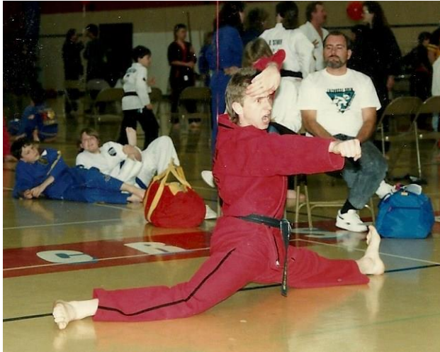
Tournament photo from the 1900's