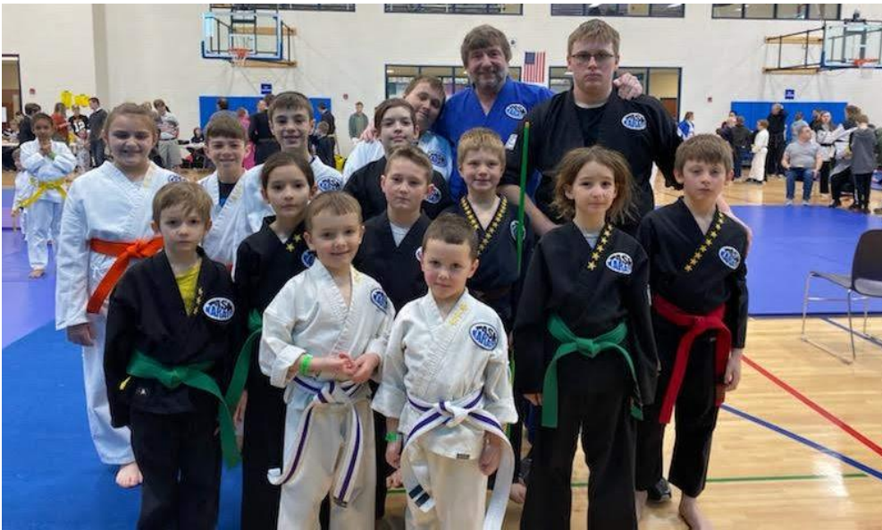
2020 Y Tournament