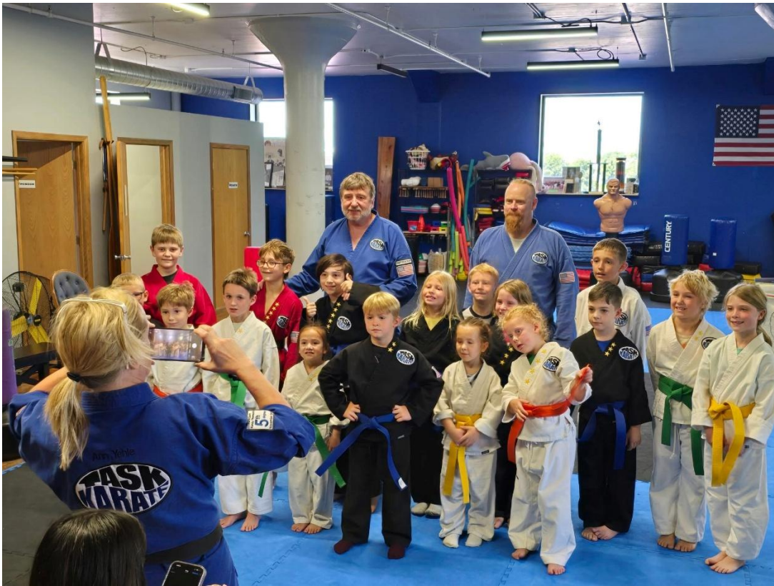
Good looking group!