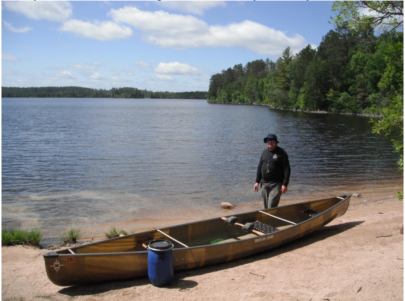
Nice beach site on Pipestone Bay!