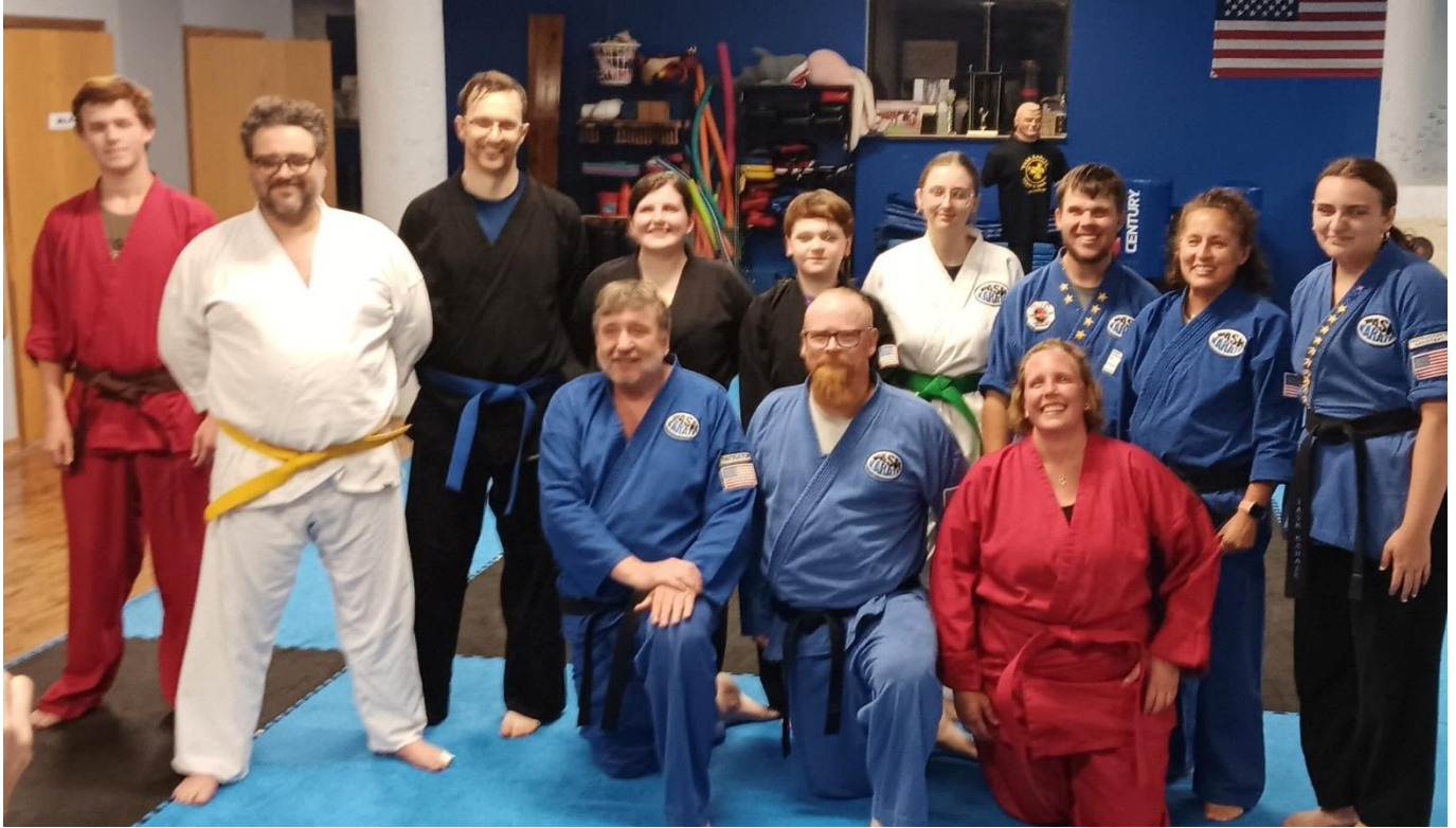
Part of the teen/adult testing group!