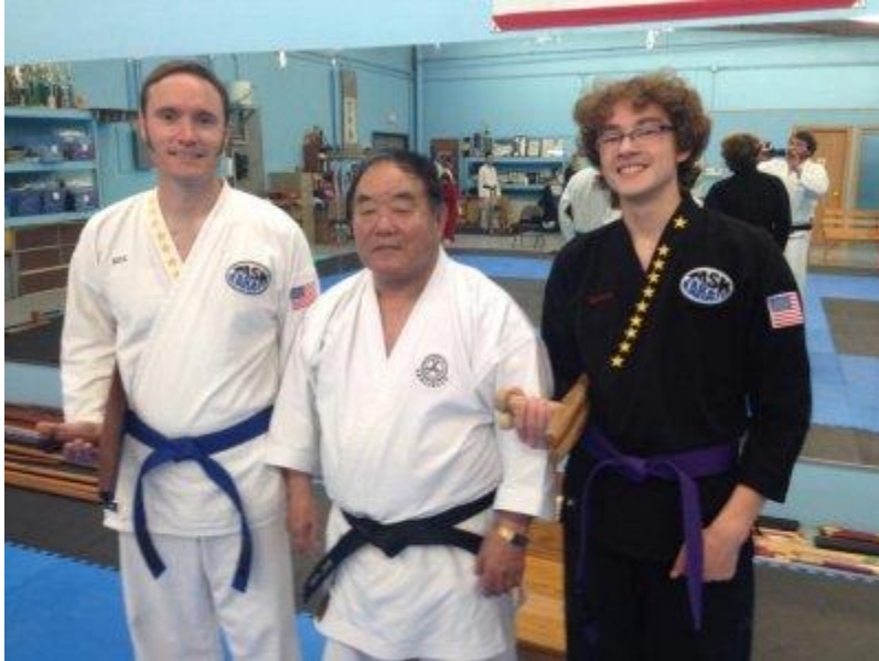
A few pictures from the Seminar!